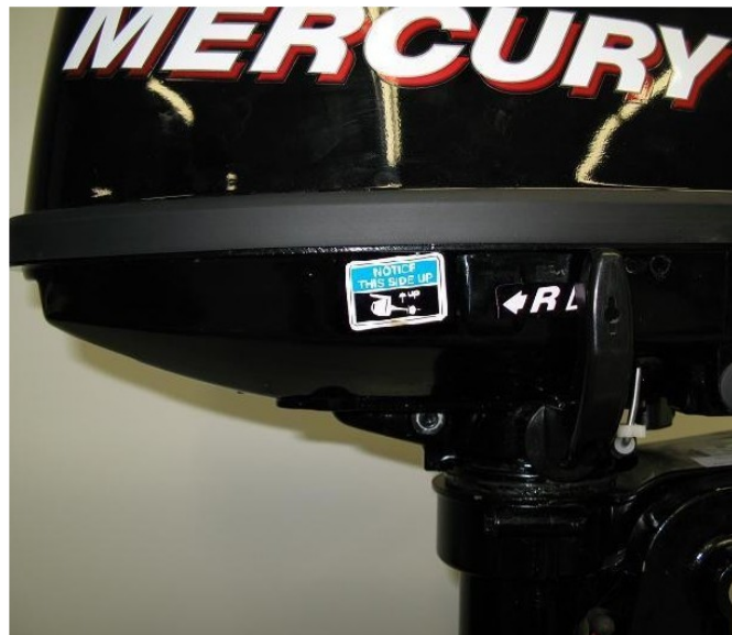
Incorrect laydown storage decal