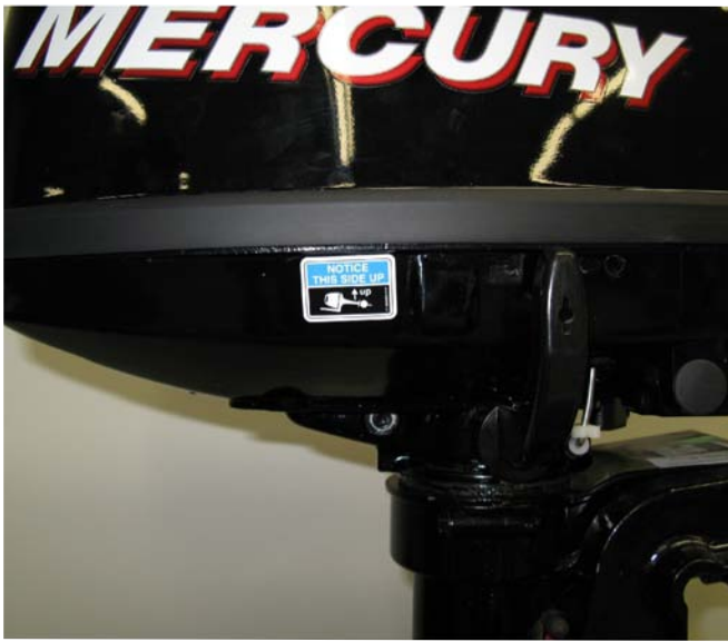
Correct laydown storage decal